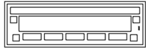
2.35 x 0.75 mm Die